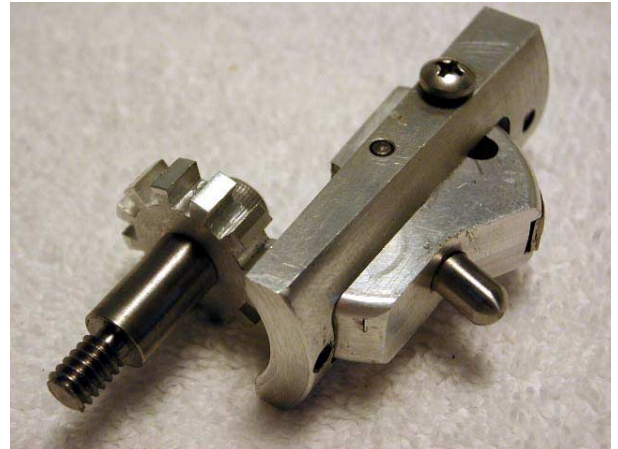
View of SP Component