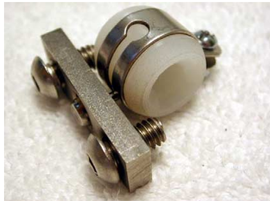
View of FFCS Component