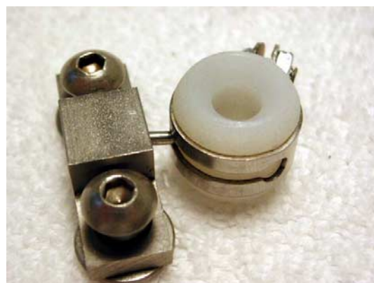
View of FFCS Component